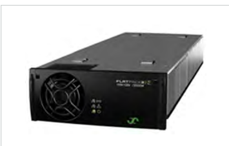
FP2 Rectifier Module

The modular architecture, industry-leading efficiency, compact size, innovative design and comprehensive monitoring and control features provide significant benefits over the current industry standard.